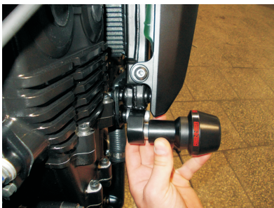
Assembly position (right side)