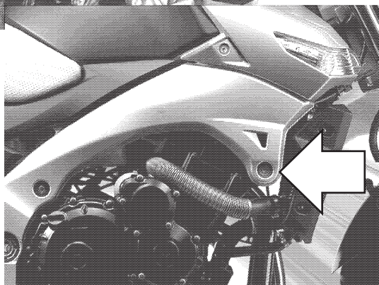
Assembly position (right side)